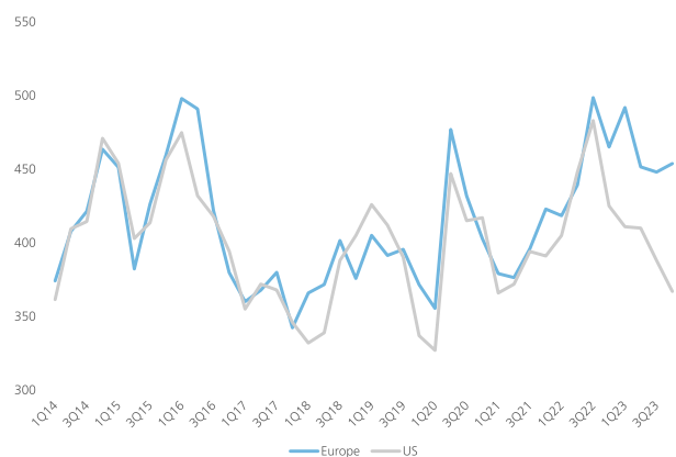
Figure1: European vs. US leveraged loan spreads

ranging from EUR 20–60mn, which is below the US median. The UK represents about 34% of the European market share, followed by France (24%) and Germany (13%), according to Deloitte. New loans are currently originated at lower-double digits, which represents a favorable yield pickup compared to EUR-leveraged loans and high yield.